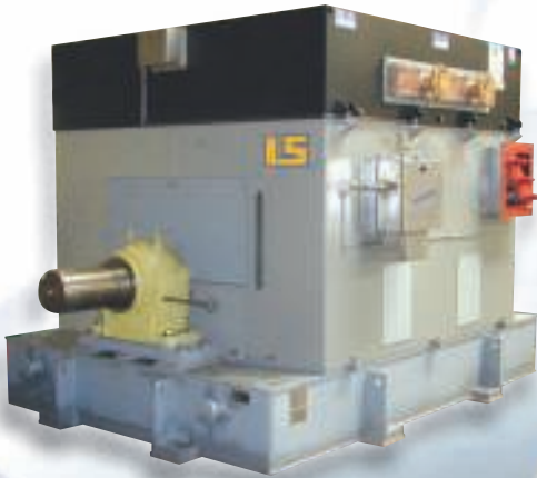
10750kW 1770 rev/min CACW 13800V 3ph 60Hz LP/IP Compressor Drive Motor 320% FLC