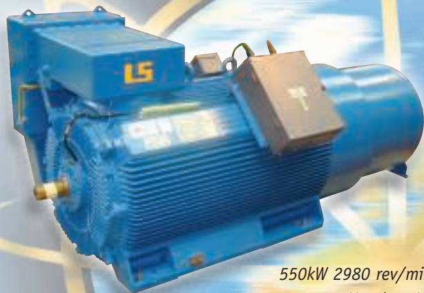
550kW 2980 rev/min 11000V 3ph 50Hz Low Noise Pump Drive Motor

Lead-time for this range of machines has been reduced through a deliberate rationalisation of production methods and component procurement, whilst still retaining the flexibility to offer application-specific motors.