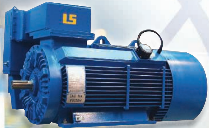
300kW 2979 rev/min 3300V 3ph 50Hz Water Pump Drive

Bearings are grease lubricated rolling element type with grease escape facility. Larger 2 pole units have rolling element bearings with an oil circulation system. A phase insulated Ex e terminal box is normally provided. Fault containing, phase segregated EEx d and Ex e Elastomeric type terminations are available as options.