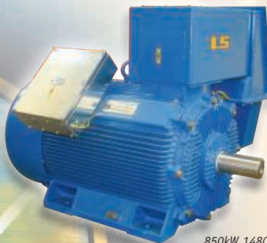
850kW 1480 rev/min 6000V 3ph 50Hz Pump Drive Motor (400% FLC)