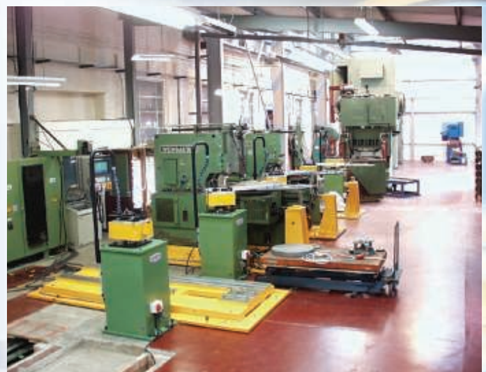
Automated Lamination Production Line