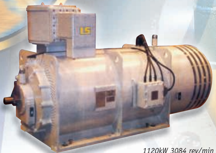
1120kW 3084 rev/min 3410V 3ph 52Hz Variable Speed Drive Crude Oil Transit Pump