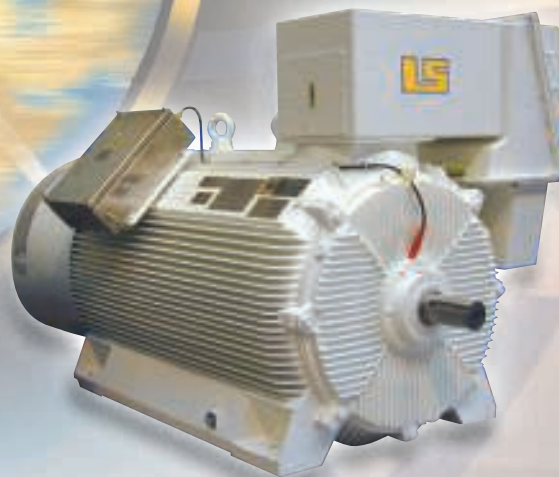
1380kW 2980 rev/min 6600V 3ph 50Hz Treated Water Pump Motor