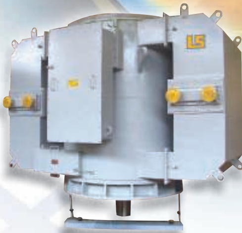
3000kW 890 rev/min CACW 6600V 3ph 60Hz Vertical Thruster Motor 500% FLC