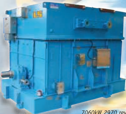
7060kW 2970 rev/min CACW 11000V 3ph 50Hz Main Oil Pump Motor 320% FLC