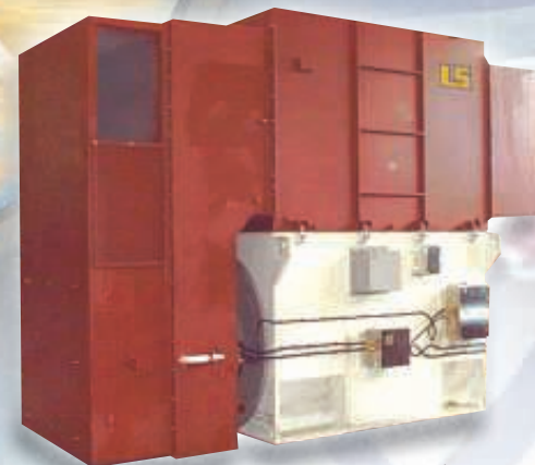
4300kW 1772 rev/min CACA 1100V 3ph 60Hz Low Noise Compressor Motor 300% FLC