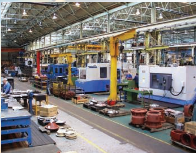
Extensive CNC Machine Shop