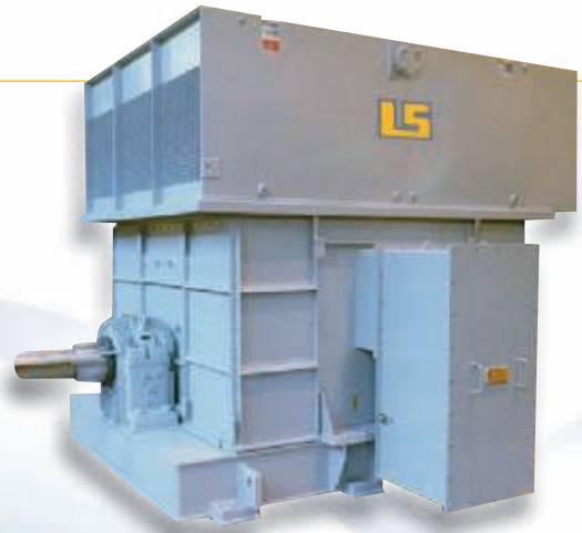
925kW 425 rev/min CACA 3300V 3ph 60Hz Reciprocating Compressor Drive Motor 500% FLC