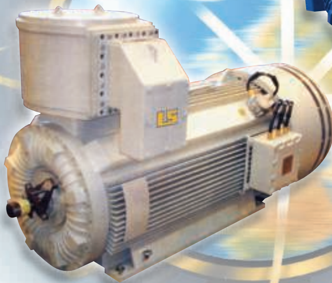
648kW 3129 rev/min 3460V 3ph 52Hz Variable Speed Drive Crude Oil Transit Pump