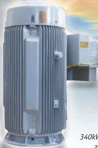
340kW 1480 rev/min 3300V 3ph 50Hz Vertical Pump Drive Motor