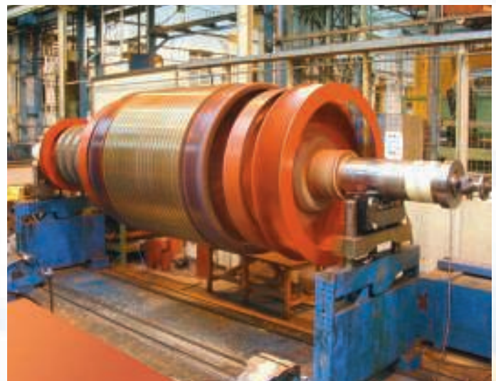
Precision Rotor Balancing Shop

The design and manufacturing processes are administered by the Company quality management system that has been assessed and certified to meet the requirements of ISO9001.