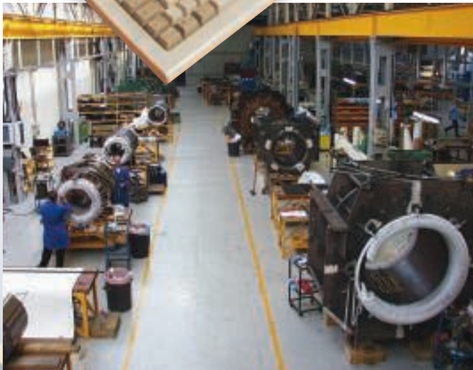
High Voltage Core Winding Shop